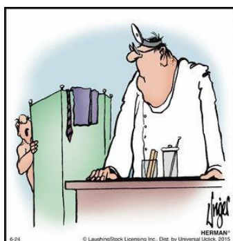
"Okay, I'm coming out now. Close your eyes!"