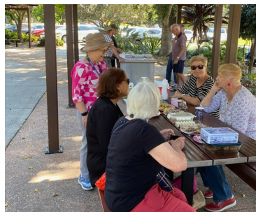
Barbecue at Pine Rivers Park