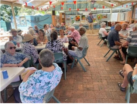
Members at the Romancing the Stone BBQ