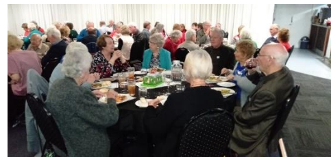
Christmas in July