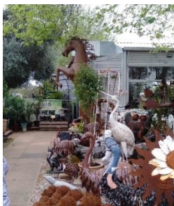
Swan Valley Station