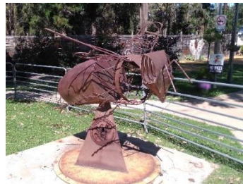
Little Eeden Honey Farm