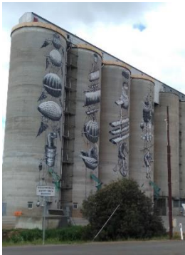
Northam Silo Art