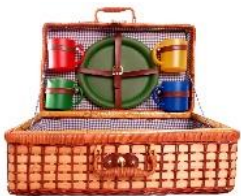
This Photo by...

What a great way to get past the rush and bustle of Christmas come join other members for a very casual and relaxing evening in Stirk Park for a "Bring everything picnic" Gives you a chance to catch up and relax with friends.