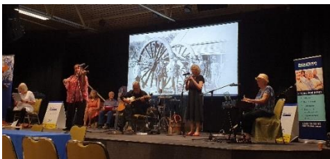
Entertainment by "SCARP"